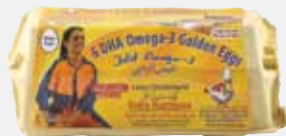
DHA OMEGA-3 EGGS