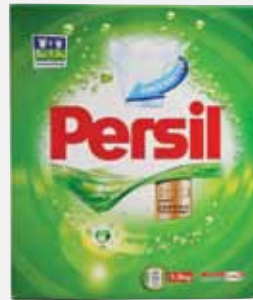
PERSIL GREEN 1.5KG