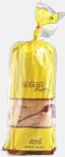
MODERN BAKERY BREAD (OR THE CHEAPEST MEDIUM WHITE LOAF)

A loaf of basic white sliced bread, eggs to go on your toast and washing powder to clean up the spills, but which shops offer the lowest prices for these staples?