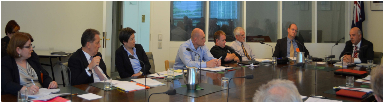
Participants at the roundtable

As a follow up to the industry roundtable reported in our last NOLS Update , Senator Chris Evans, Minister for Tertiary Education, Skills, Science and Research and Senator Penny Wong, Minister for Finance and Deregulation, hosted a second industry roundtable in Canberra on 31 October 2012. (See page 4 for a full list of industry participants).