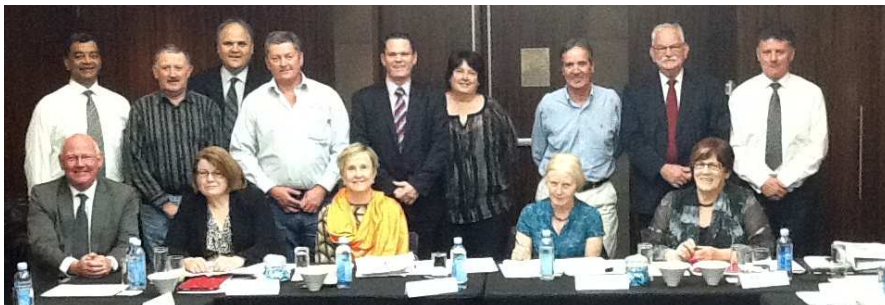
Participants at the Refrigeration and Air-conditioning OLAC

The ministers acknowledged the work that had been undertaken in reaching an agreed position. Recommendations arising from the interim OLACs are going to the Standing Committee on Federal Financial Relations and will provide input into the COAG decisions on the final policy model for national licensing of these occupations.